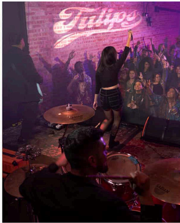
📷 'If you know, you know': the not-quite speakeasy Nickel City (left); and local live music favourite Tulips.