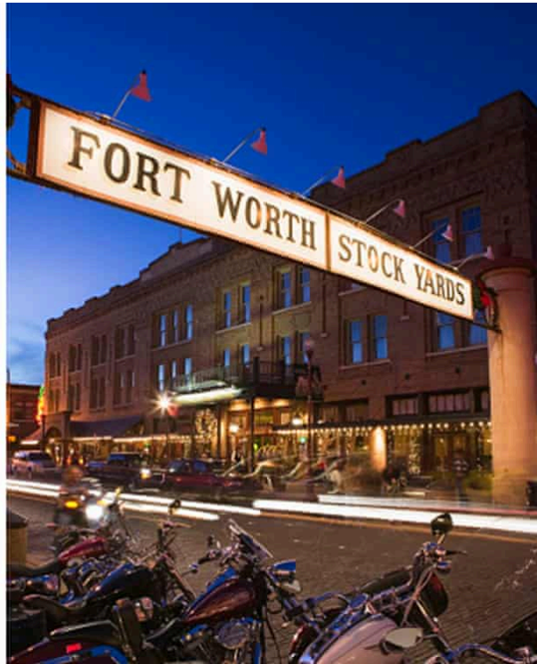
📷 The Fort Worth Water Gardens, a modernist landscape marvel (left); saloon hospitality at the Stockyards.

Morris also recommends the Fort Worth Water Gardens , which were designed by architect Philip Johnson, and have been described as an “otherworldly” example of modernist landscape architecture right in the heart of the city.